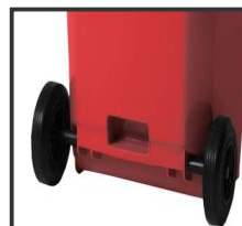
Durable built in step to assist in tilting the loaded bin.