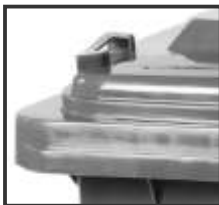
Tight seal lid helps to reduce odors, leaks and rodents.