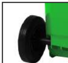
Solid steel axle & 8” rubber wheels. Plastic wheels available.